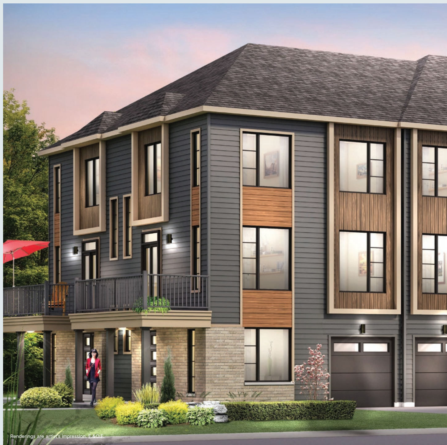
MCKEE CORNER ELEVATION A