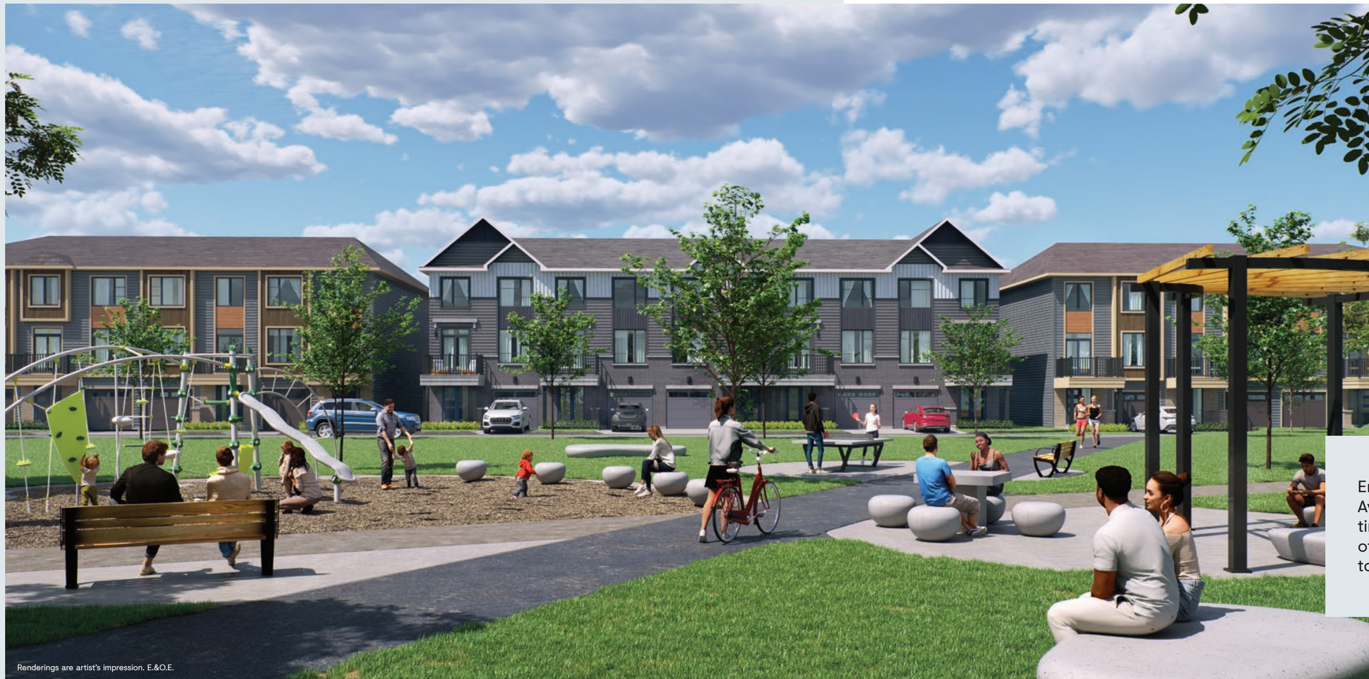
Renderings are artist's impression. E.&O.E.

Explore a range of 2- to 3-bedroom designs crafted to suit your needs. Each contemporary suite comes with a generous-sized private balcony, a private garage, walk-in closets, and oversized windows that let in a bountiful amount of natural light.